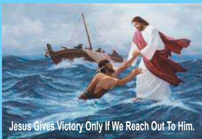
Jesus Gives Victory Only If We Reach Out To Him.