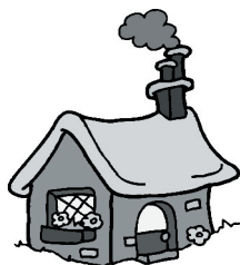
The Early Christians Met in Their Homes.

In fact, as recorded in Acts 9:2, when Saul—later Paul— went from house to house in the persecution of those who gave up Judaism, he searched for those who were of “the Way.” It was not until at least ten years later that those of “the Way” were called Christians in Antioch of Syria.