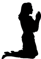
Freedom In Worship.

cannot be bound on the consciences of others. Likewise, if someone raises his or her hands in worship, it is a matter of freedom. Such behavior cannot become a tradition to be bound on others. These are matters that have no authority in the word of God, and thus fall in the area of freedom of choice.