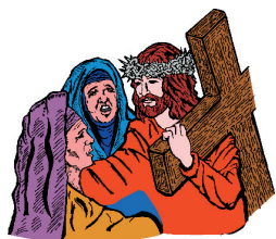
Lovine One Another As He Loved Us.

We must not forget what Jesus said in Mark 8:35. If we would be the church of Christ, then we must lose our lives for the sake of the gospel of Christ. In other words, any church that is not in some way contributing to the preaching of the gospel is not a church of the Christ who forsook all in heaven in order to bring the