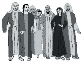
Church Is People, Not The Performance Of Ceremonies.

It is for this reason that we are very cautious about identifying the people of God today by what is legally performed on Sunday morning during the “hour of worship.” We would subsequently challenge everyone