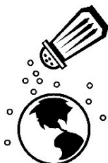
The First Disciples Sprinkled The Salt Of The Gospel In All The World.

Those local disciples who had “possessions and goods” sold them in order to care for their new visiting brothers who were soon to return to their homelands with the message of the gospel. The selling of the “possessions and goods” by the local Christians, therefore, was an evangelistic effort on the part of the members who resided in Jerusalem. Acts 2:45 was an evangelistic partnership of the local disciples with those new disciples who were retuning home throughout the world in order to preach the gospel that they had learned and obeyed in Jerusalem.