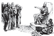
David Sat On The Throne Of God.

Peter’s initial gospel message began with King David. King David of Israel knew that the authority of his kingdom reign always originated from heaven at the throne of God . Therefore, when God promised that He would in the future set Someone on his throne, David correctly concluded that the One who would eventually reign on his throne would rule from heaven with the authority of God.