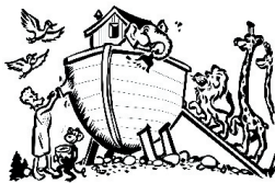
AN EVENT OF FAITH

God revealed something to Noah and his family that encouraged them to persevere through faith throughout the one hundred years it took to build the ark (Hb 11:7). And then there was Abraham who pulled up tent stakes in Ur of the Chaldeas, took his wife by the hand, and then headed out by faith to a land to which neither of them had been before (Hb 11:8-10). It says in the New Testament of this permanent excursion that Abraham “was looking for a city that has foundations, whose builder and maker is God” (Hb 11:10).