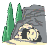
Power Of The Resurrection

The man Jesus was proclaimed to be Son of God by the resurrection, and subsequently proven to be the Christ (Messiah). It was by the power of His resurrection that God proved that He was His Son (Rm 1:4). He was now the resurrected and reigning King